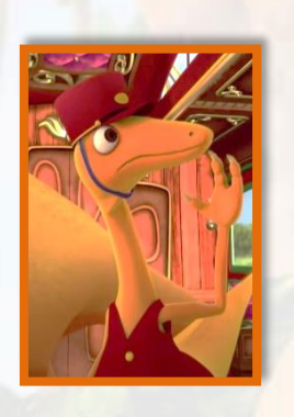
5. Mr. Conductor