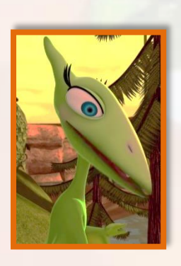
6. Mrs. Pteranodon